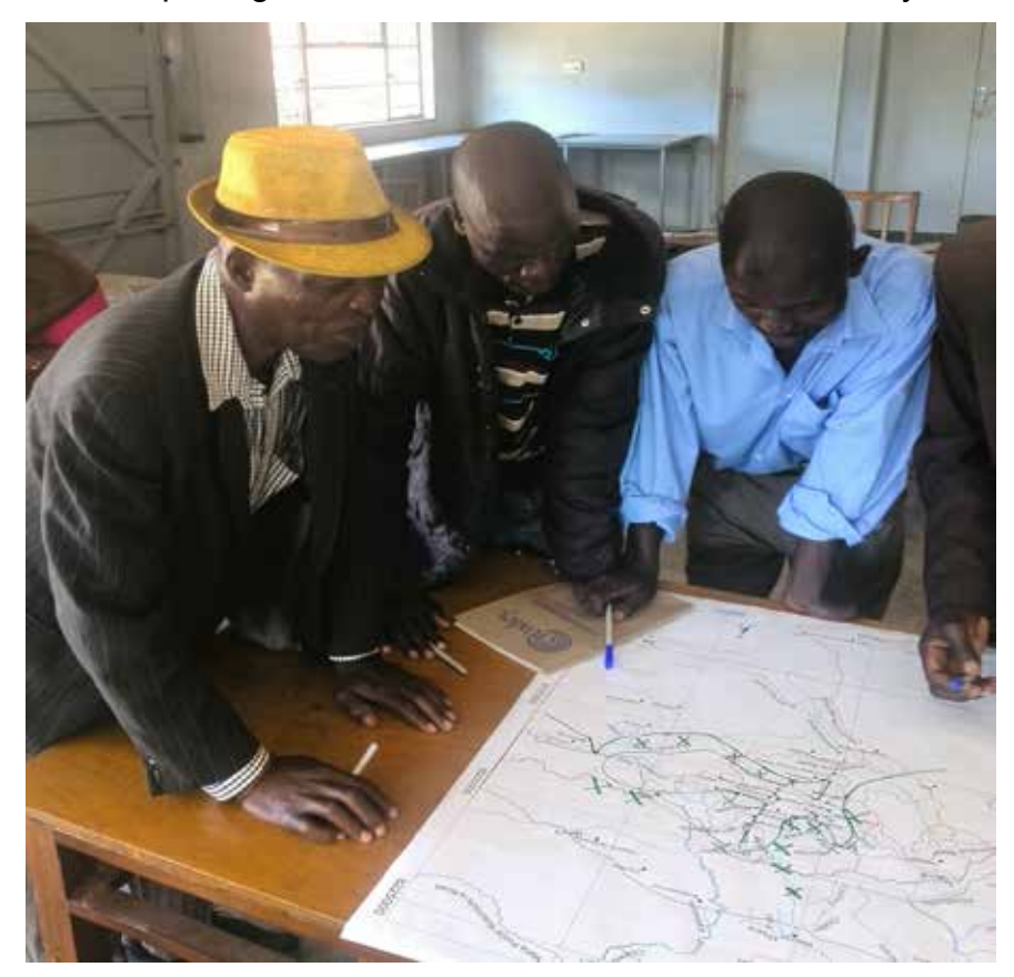
Villagers participate in tsetse mapping

The result was that the two key government ministries concerned with tsetse and trypanosomiasis in Zimbabwe, those of health and agriculture, found no evidence of tsetse at their study sites and no longer considered tsetse a problem