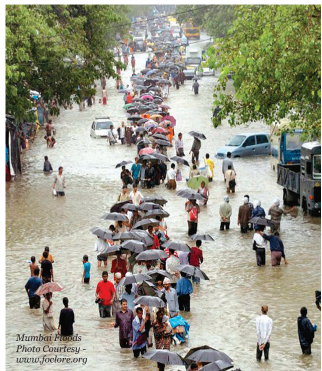
Mumbai Floods

Development Studies (IDS), University of Sussex, STEPS Centre, Brighton; Norwegian Institute for Water Research (NIVA), Oslo; Indian Institute of Health Management Research University (IIHMR);