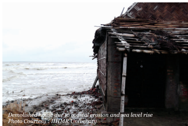
Demolished house due to coastal erosion and sea level rise

of multiple knowledge frames. These include policy experts, civil society actors, scientists and implementing organisations at the sub-national, national and global level. We will engage in discussions with participants that revolve around informed and inclusive decision making related to uncertainty.