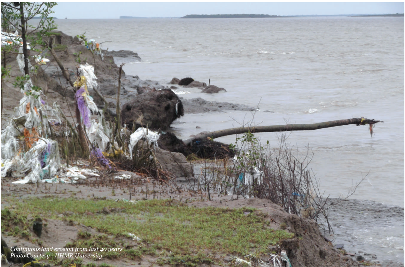
Continuous land erosion from last 40 years