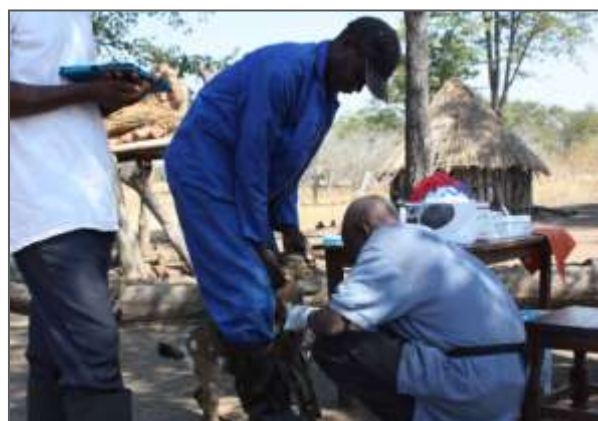
LIVESTOCK SAMPLING

The research is being undertaken over multiple sites along the transect and is using and integrating information from tsetse abundance studies, trypanosomiasis surveys in livestock, environmental data and social science studies. The latter includes participatory mapping, focus group discussions, key informant interviews, structured questionnaires and transect walks. There is a clear multidisciplinary element to the research, including using participatory mapping and the survey to feed an agent-based model, allowing an estimation to be made of the movements of livestock and people. This is important as a linear or meandering route could affect disease transmission rates in model simulations. The overall objective is to capture