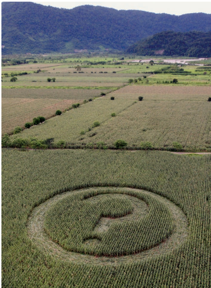
A UK crop circle, created by activists to signify uncertainty over where genetic contamination can occur.

OBITUARY Brian Marsden, keeper of comets, remembered p.1042